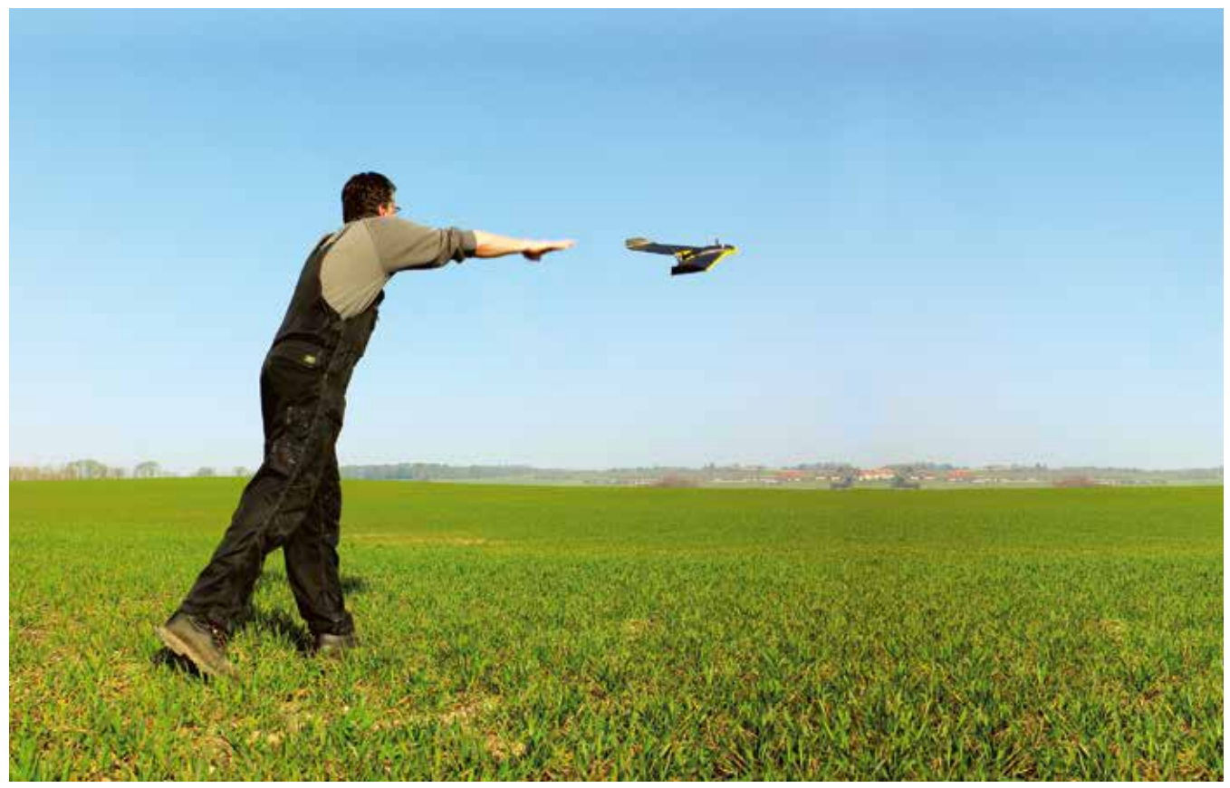
An operator launches the senseFly eBee, a professional mapping drone Use this fully autonomous drone to capture high-resolution aerial photos that you can transform into accurate 2D orthomosaics & 3D models..

military training. Model aircraft, the third category, is for hobby and recreation. Note that there are no certificates for any type of business use—and that includes agriculture—unless a company has received an exemption. The FAA has given a total of only twentyeight exemptions, as of February 10, 2015.