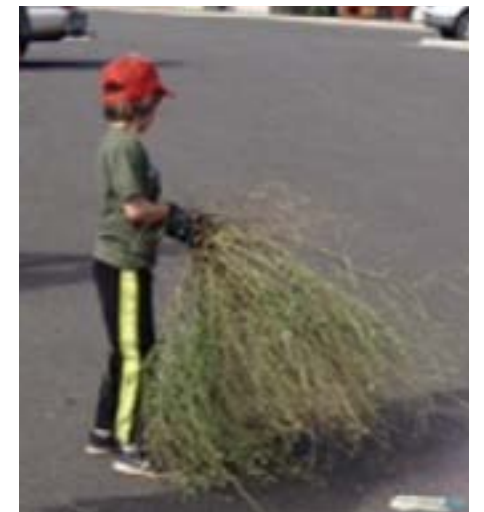
A student carries his "trophy weed"