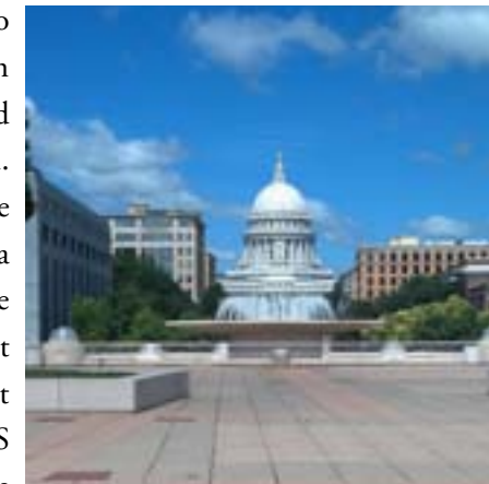
A view of the WI Capitol Building

I recently had the opportunity to attend the 30th Annual Conference on Distance Teaching and Learning hosted by the University of Wisconsin, Madison. Not only was it an incredible conference venue on the shores of Lake Monona right next to the state capitol, but the conference provided me with an excellent opportunity to compare and contrast our unique online MS program in LRES with other online programs around the country and to learn about best practices in distance education. The biggest take-home message for me was that our new and growing program is on the right track. In this era of Massive Open Online Courses (MOOCs), our program is striving for something quite the opposite – the "localization" of online education. Our students are attracted to MSU and LRES because we offer small, interactive, locally-tailored classes. This is a unique strength of our program and helps set us apart in the ever-changing, and rapidly expanding world of distance education.