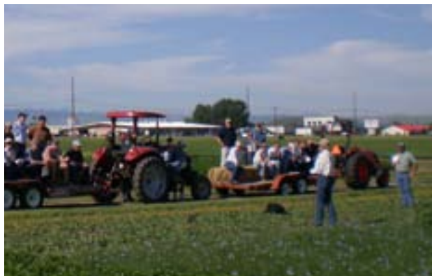
Attendees enjoy a presentation at the Post Research Farm