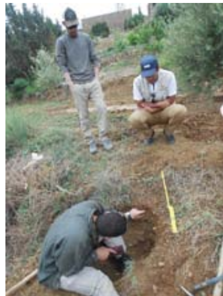
SFBS students analyze soils in the edge of a local garden in Zawiya Ahansal, Morocco.