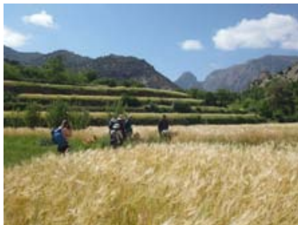
SFBS students interview local farmers in their fields in Zawiya Ahansal, Morocco during a study abroad trip in June 2014.

The agriculture in Zawiya Ahansal consists of growing vegetables and other crops on flood-irrigated, terraced fields in river flood plains, and grazing sheep and goats in mountain pastures. The main crops are six-row barely, alfalfa, and corn, all of which are used for animal fodder.