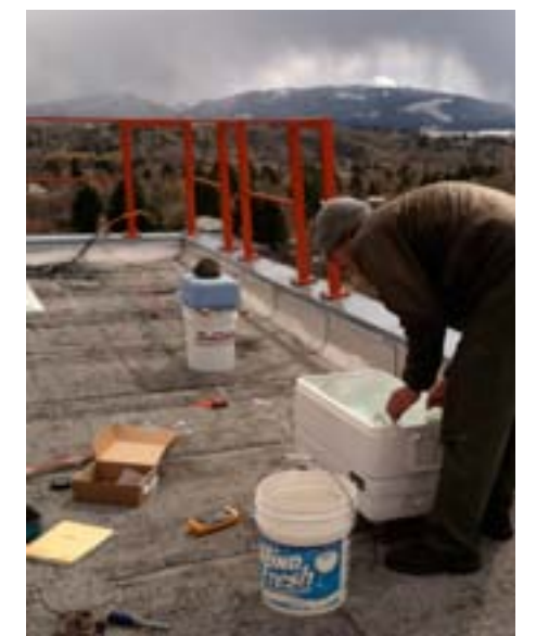
Sam Carlson, graduate student, checks a cooler on the roof of Cobleigh Hall

experimental coolers – to predict daily variation in water temperature in the coolers. We have other sensors recording water temperature in the coolers to see if the temperatures predicted by the computer model are correct. When our model successfully predicts water temperature in the coolers, we know it is simulating heat exchange between the atmosphere and water correctly. Then, we can combine this atmospheric model with a model that simulates downstream