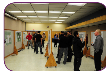
Research colloquium 2011